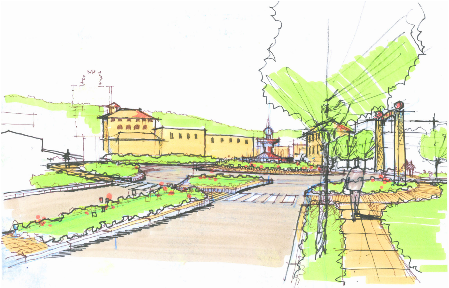
Enhanced SR 56 roundabout concept