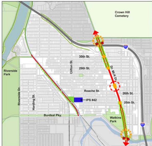
Martin Luther King Jr. Street Vision.

Bring your ideas and suggestions about needed improvements to Martin Luther King Jr. Street