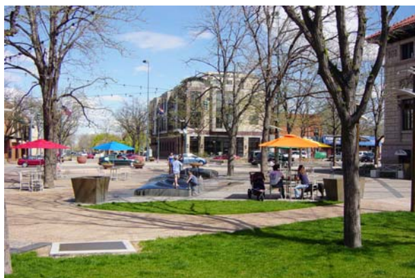
Martin Luther King Jr. placemaking plaza with new development.

Community members, district business and property owners, local developers, and any other interested parties are encouraged to attend the workshop.